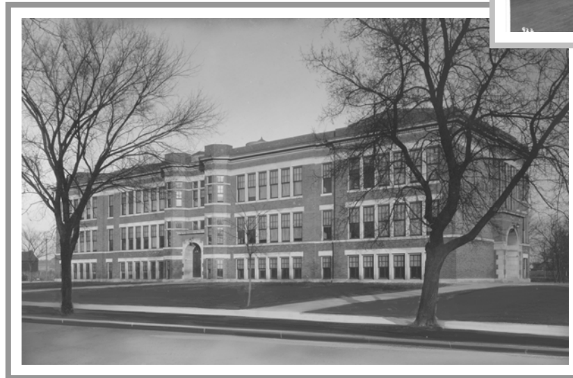
Lower middle photo of the new Tuttle School at 18 th & Talmadge Aves SE; this was the 3 rd Tuttle School and the first one at this location: 1910, Minneapolis Public Schools